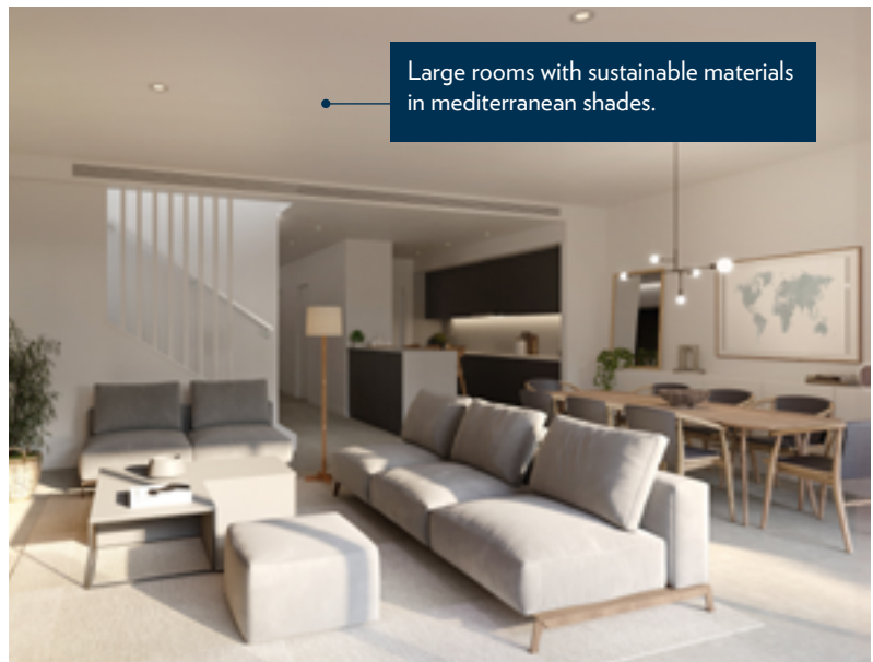
Large rooms with sustainable materials in mediterranean shades.