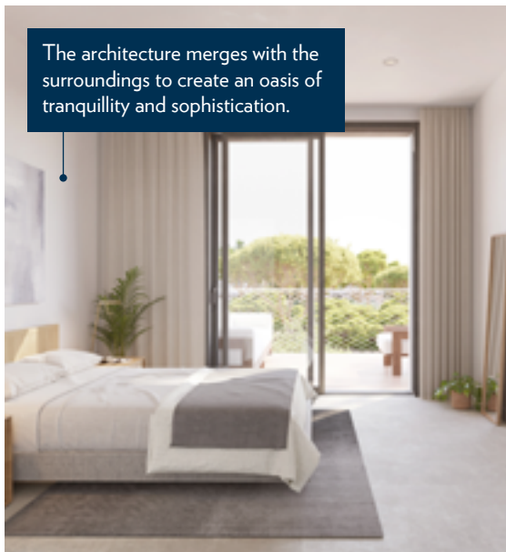
The architecture merges with the surroundings to create an oasis of tranquillity and sophistication.