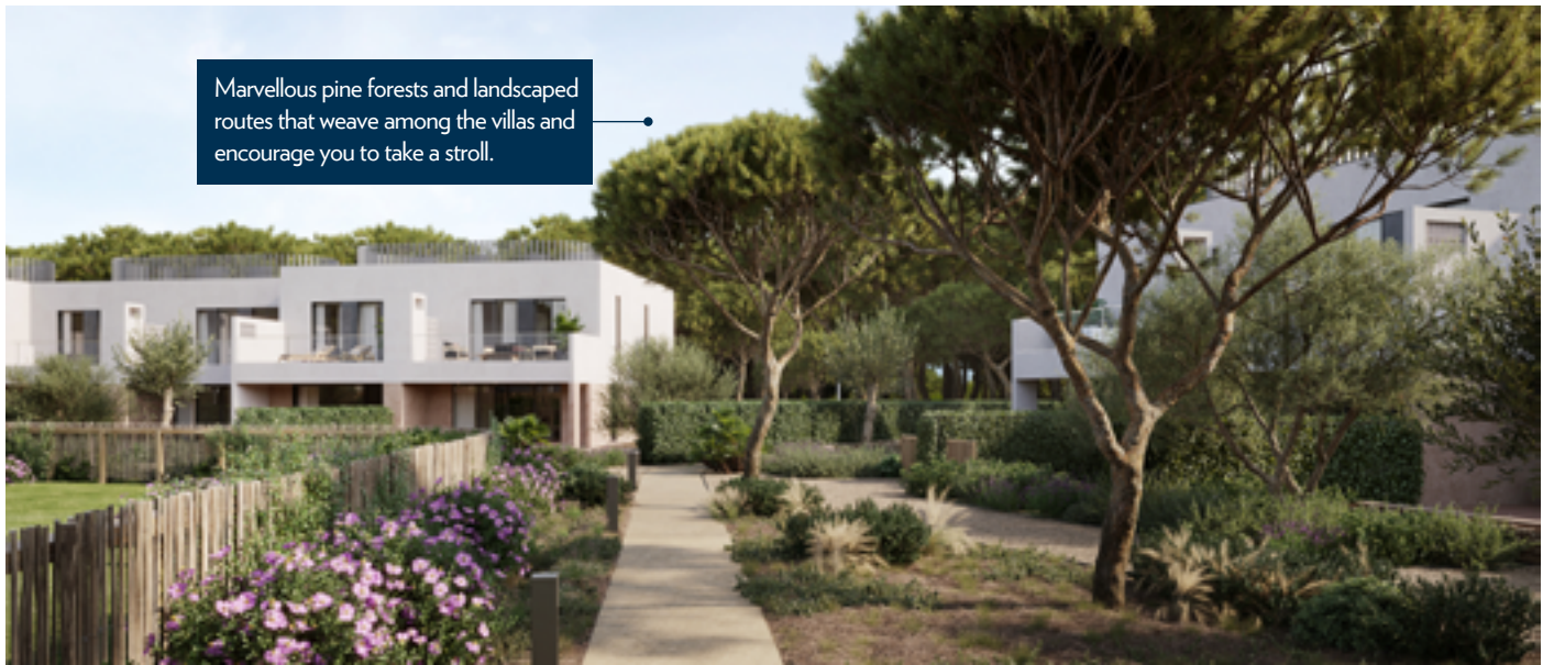
Marvellous pine forests and landscaped routes that weave among the villas and encourage you to take a stroll.