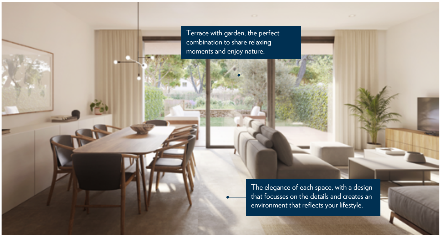
Terrace with garden, the perfect combination to share relaxing moments and enjoy nature.